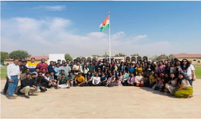
JAISALMER WAR MUSEUM