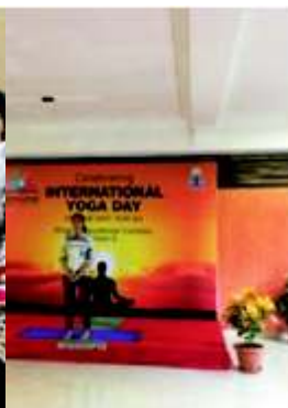
International Yoga day Celebrations At Atharva